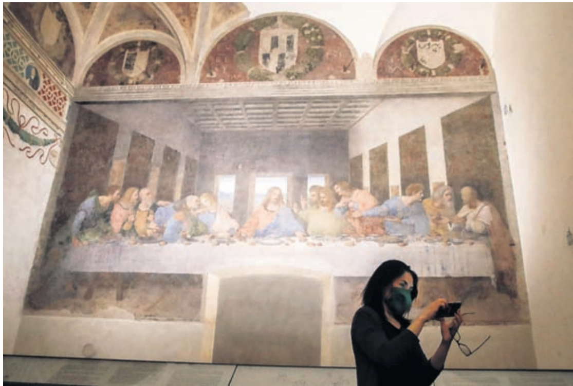
A visitor takes a selfie as she admires Leonardo da Vinci's mural painting 'The Last Supper', dating back to 1495-1498 and preserved at the ex-Renaissance refectory of the convent adjacent to the sanctuary of Santa Maria delle Grazie church, in Milan, Italy, Wednesday, June 10, 2020.

The virus has infected 7.2 million people worldwide and killed nearly 412,000, about 180,000 of them in Europe, according to official figures tallied by Johns Hopkins University. The true toll is believed to be much higher because many people died without being tested. Austrian Foreign Mi-